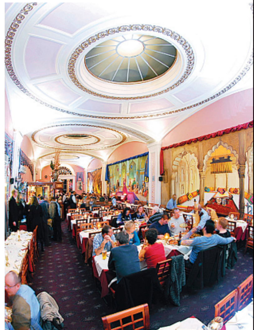
The Eastern Eye's stunning dining area where Georgian Architecture has an Eastern backdrop

Either way, this is one Indian restaurant that is not to be missed. It is quite a unique rarity. Boasting one of Bath's few true Georgian interiors, with huge glass domed ceilings and giant hand painted art works laden across the walls. Coupled with the extensive menu that is littered with several authentic homegrown dishes you simply won't find anywhere else, the restaurant provides an impressive dining experience. It's an altogether quite elaborate and grandiose affair, still retaining that warm local feel and with affordable prices to boot. The Eastern Eye is one of Bath's crowning jewels as far as restaurants are concerned, and if any of Mr Choudhury's future plans prosper, it can only get better.